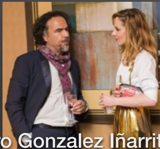
Oscar Winner - Alejandro Gonzalez Iñarritu Film Director