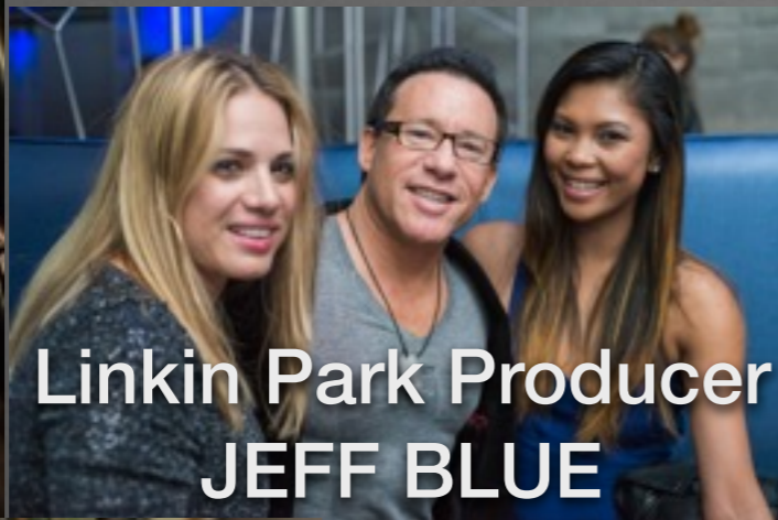
Linkin Park Producer JEFF BLUE