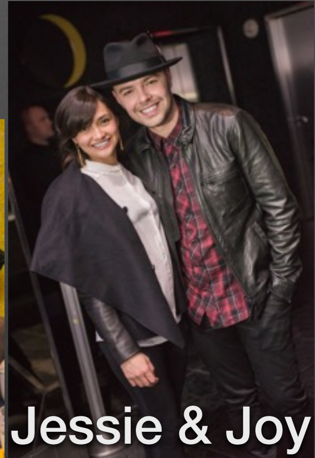
Jessie & Joy