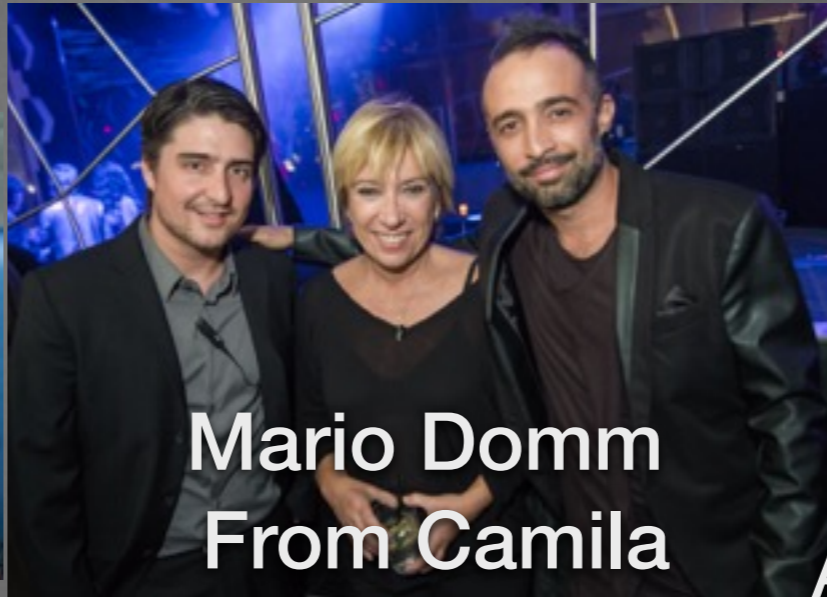
Mario Domm From Camila