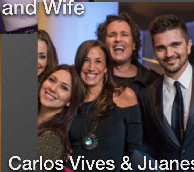
Carlos Vives & Juanes