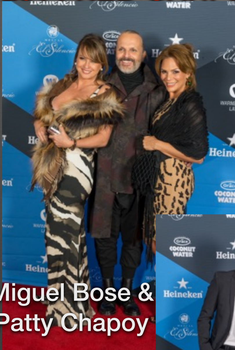
Miguel Bose & Patty Chapoy