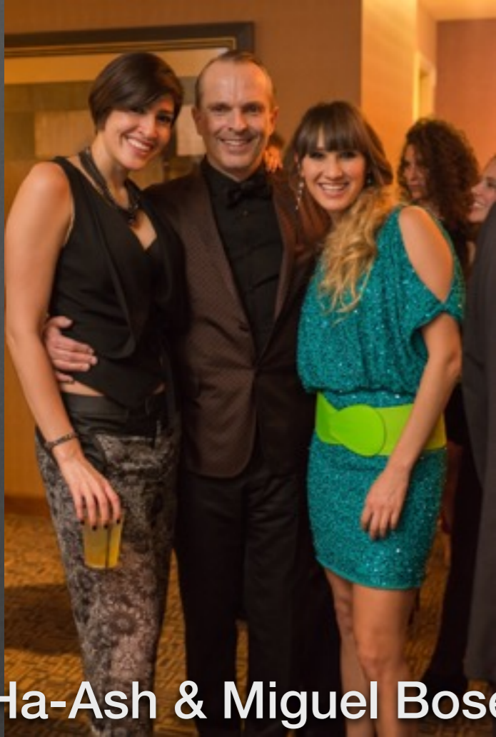
Ha-Ash & Miguel Bose