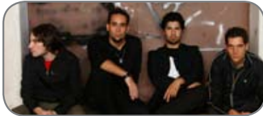
EL OCTAVO DIA