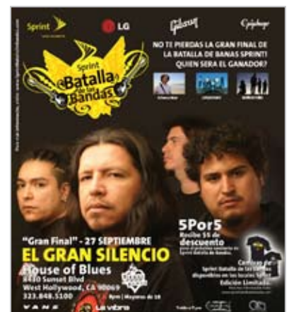
Publication Date: Sep. 21 Special Guest: El Gran Silencio @ House of Blues