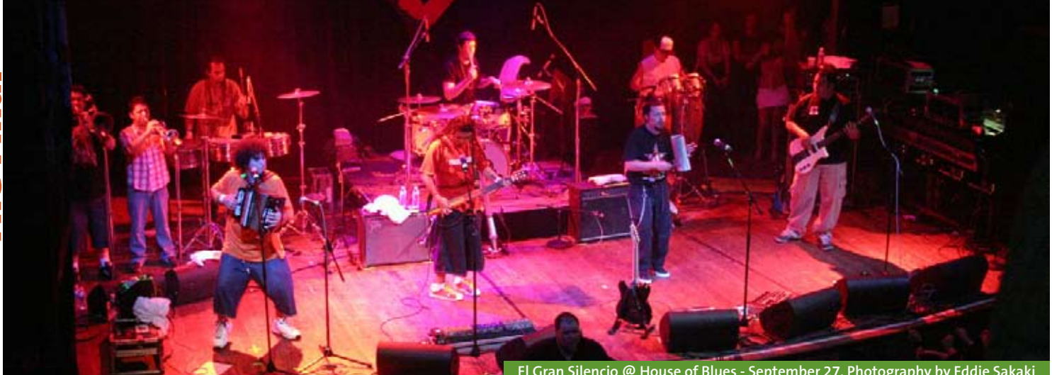
El Gran Silencio @ House of Blues - September 27.

1st Place: UPGROUND $15,000 value in Gibson instruments LG Cell Phones for band members (8) Sprint free service for many months 8 pairs of Vans shoes per band member