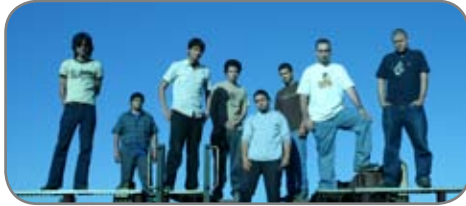
UPGROUND 1st Place