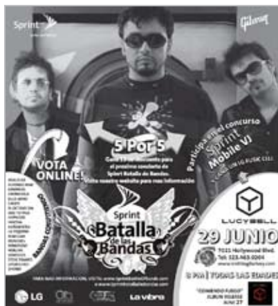
Publication Date: May 18 & June 1 Special Guest: Lucybell @ Knitting Factory