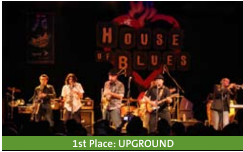
1st Place: UPGROUND

3rd Place: KOÑORTEÑO $5,000 value in Gibson instruments 8 pairs of Vans shoes per band member