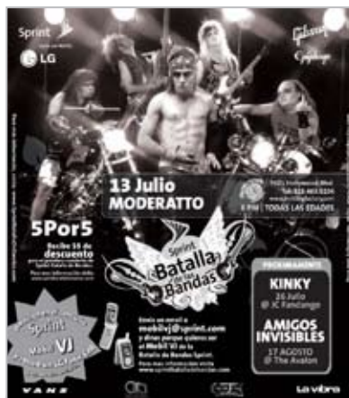
Publication Date: June 29 Special Guest: Moderatto @ Knitting Factory