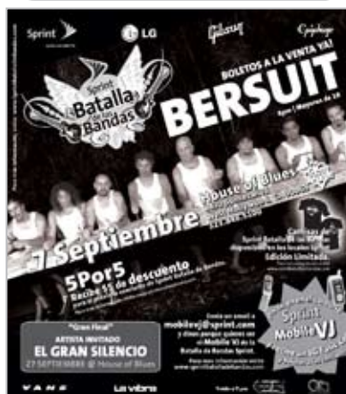
Publication Date: August 24 Special Guest: Bersuit @ House of Blues