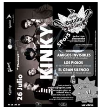
Publication Date: July 13 Special Guest: Kinky @ J.C. Fandango