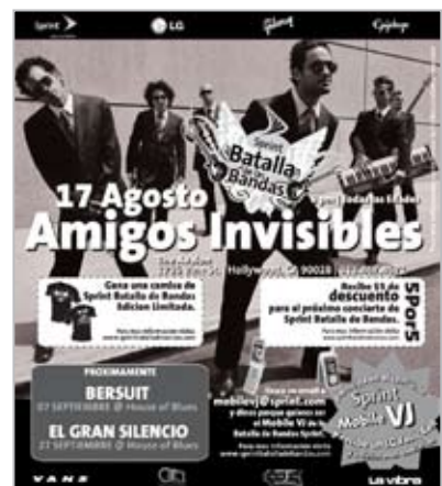
Publication Date: August 10 Special Guest: Amigos Invisible @ The Avalon