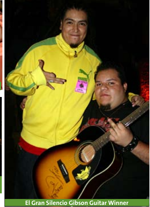
El Gran Silencio Gibson Guitar Winner