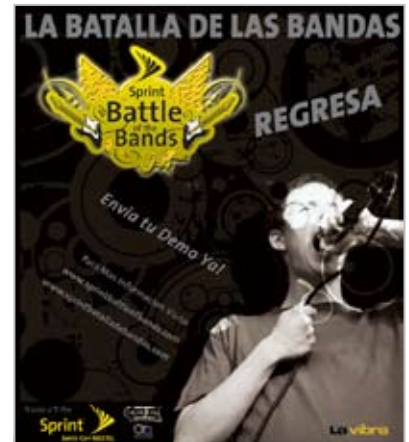
Publication Date: May 4 Opening of Sprint Battle of the Bands