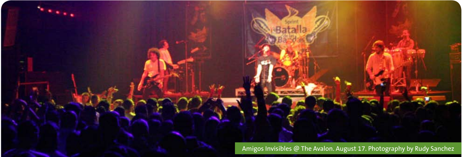
Amigos Invisibles @ The Avalon. August 17.