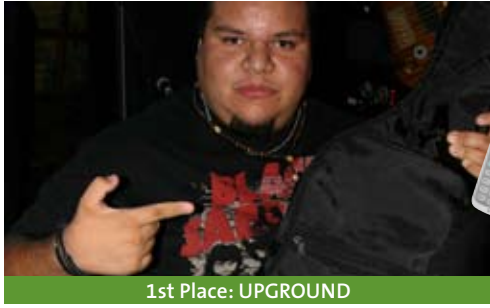
1st Place: UPGROUND