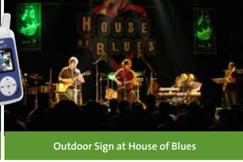
Outdoor Sign at House of Blues