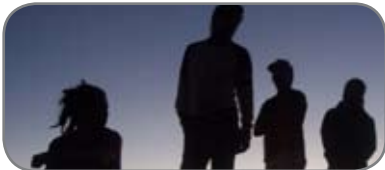
KOÑORTEÑO 3rd Place